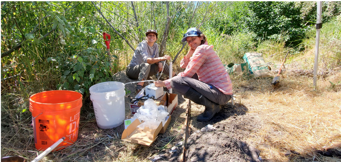
Installing & developing groundwater monitoring wells in Chiliwist Creek with MBP's Director and our fantastic 2022 summer intern from Colorado College.