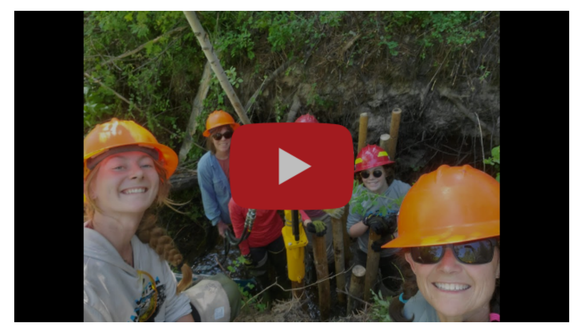
Methow Beaver Project Give Methow 2023, by Terry Hunt